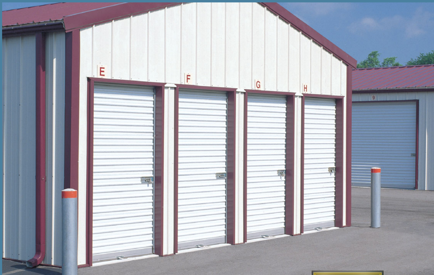
Light Commercial DS-75 Mini Roll-Up Doors